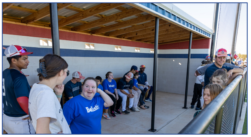
The League of Their Own co-ed softball group took to the Avedis Adaptive Field during the event. The league was established to provide a way for individuals with disabilities to play the sport.