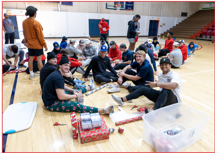
Seminole State College student-athletes and coaches volunteered their time at the beginning of December to wrap more than 200 gifts for the annual Earl Knowles free community Christmas dinner, organized by the Seminole Rotary Club.