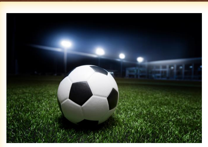
SSC Women's Soccer Team to Begin this Fall