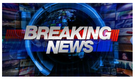
Physical Therapy Assistant Program Receives 5-Year Certification!