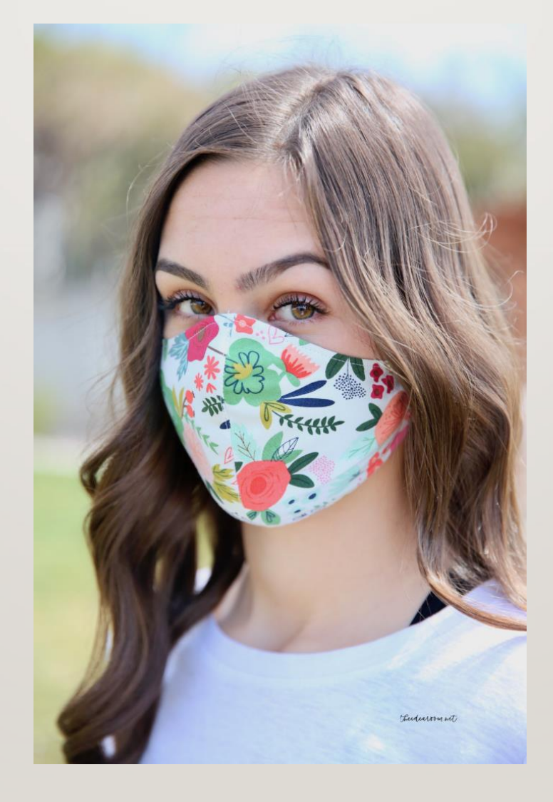
Speaking with and without a mask