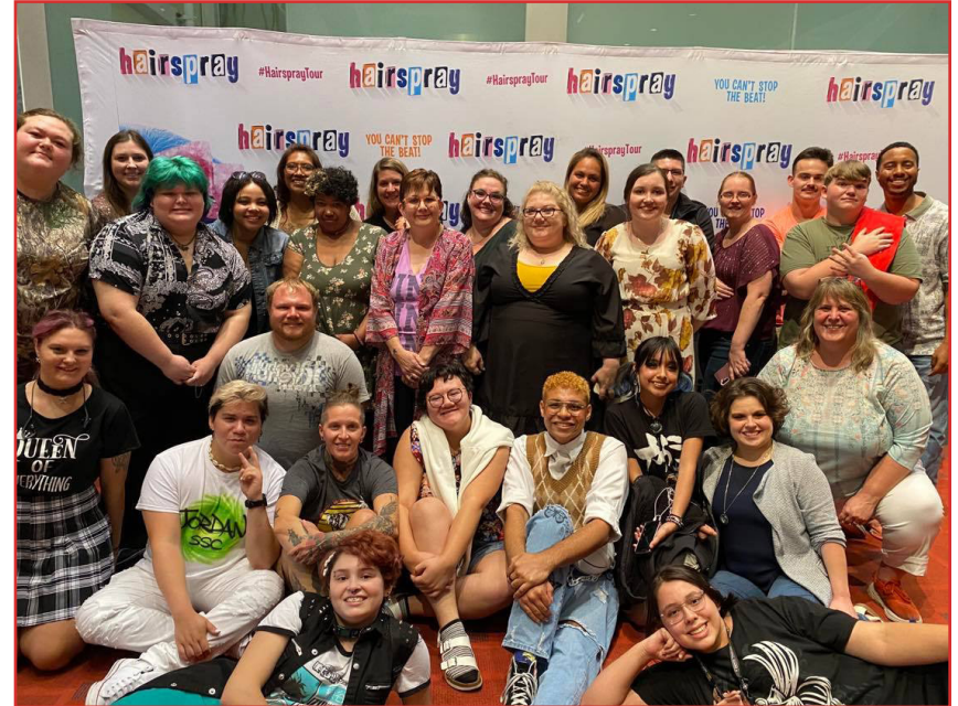
Student Support Services and STEM Student Support Services recently sponsored a trip to see the production of “Hairspray” at the Oklahoma City Civic Center. Students posed for a photo following the performance.