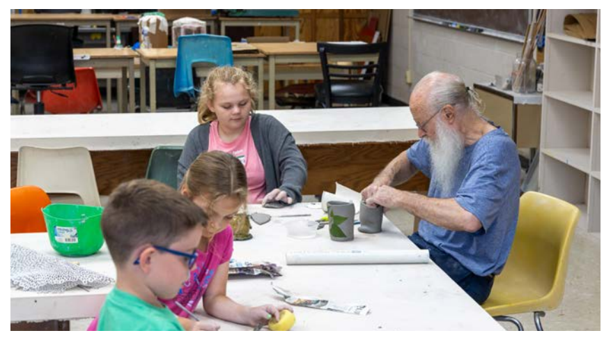
Children can now sign up for SSC's Kids on Campus Summer Camps. Themed camps include Outdoor, STEM, Lego, Art and Ceramics (pictured).

Seminole State College will host its annual Kids on Campus summer camps for children and teens aged 5 to 17 across two sessions, offering a variety of activities. The camp is hosted by SSC's Business and Industry program.