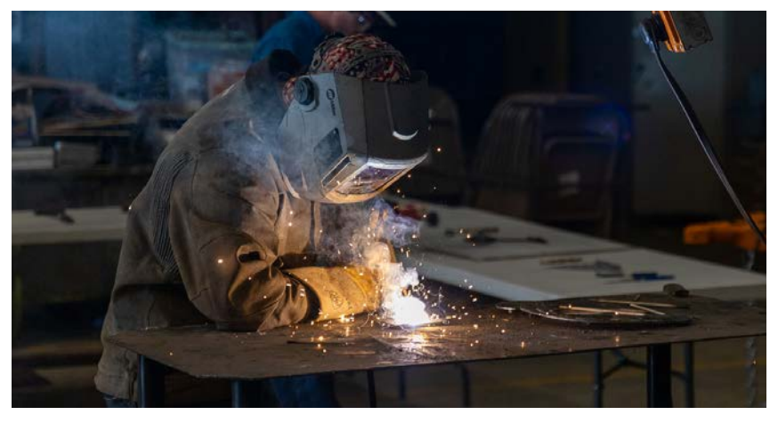
High school FFA students compete in the Ag Mechanics contest.