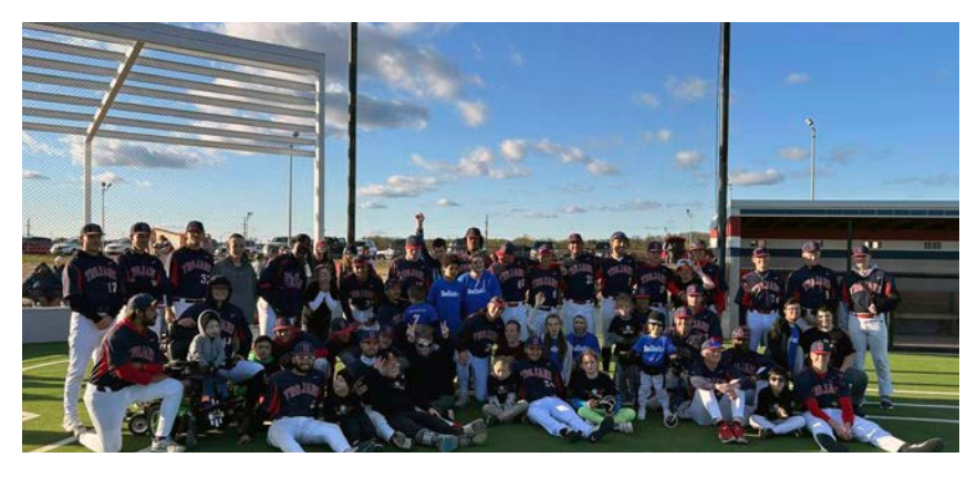
The SSC baseball team poses with members of a League of Their Own following a game on April 2.

Seminole State College Trojan baseball players worked with members of A League of Their Own at the Avedis Foundation Adaptive Field, located within the Brian Crawford Memorial Sports Complex on April 2. The softball team volunteered the following week on April 8. The League is a co-ed softball league established to provide an avenue for individuals with cognitive or physical disabilities to play baseball. This