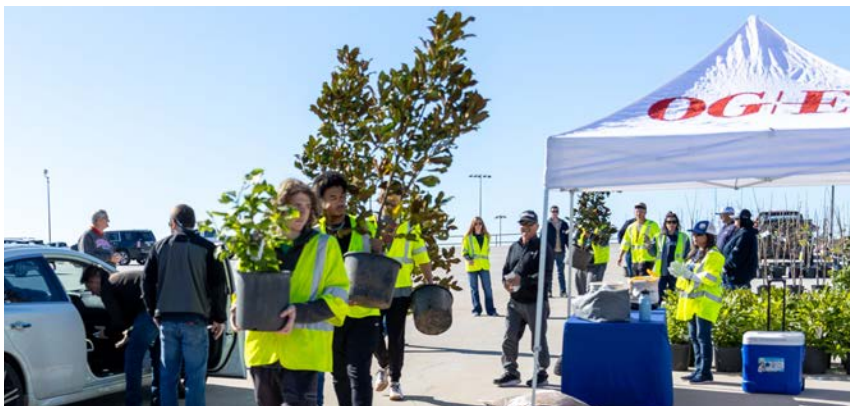
OGEE employees and Seminole State College students planted 10 trees at the Brian Crawford Memorial Sports Complex on April 4. As part of the company's environmental stewardship program, OGEE donated 10 oak and cypress trees to SSC, as well as 40 trees to the City of Seminole. The company also gave away 90 trees to the public.