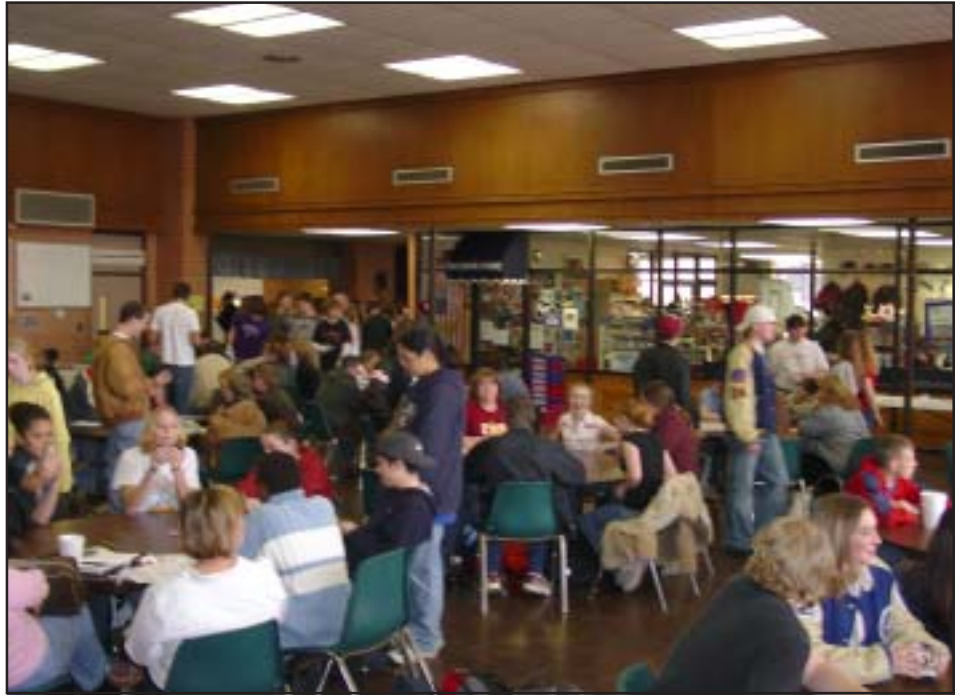
More than 1,000 students from area high schools gathered at the Seminole State College campus in early March to compete in the College's 32 nd Annual Interscholastic Meet.

Students competed in Algebra I and II, American History, American Literature, Biology, Bookkeeping, Business, Chemistry, Civics, Computer Science, English Literature, General Physical Science, Geography, Geometry, Grammar, Health Wellness, Journalism, Keyboarding I, Keyboarding I and II, Oklahoma History, Physics, Psychology, Reading, Spanish I and II, World History, and Vocabulary.