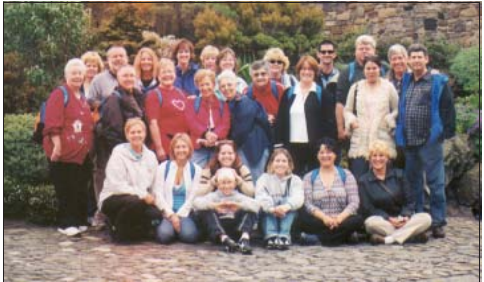
The 2003 Foreign Studies Class to Italy

"Touring other countries is one of the best forms of education you can experience you can't even compare seeing St. Paul's