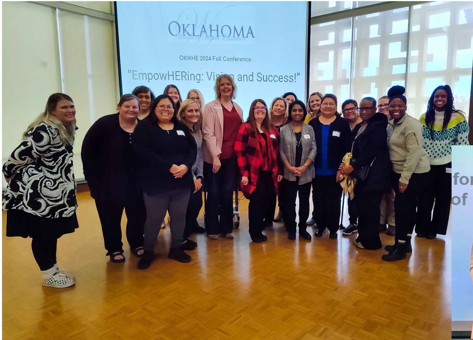
19 SSC Representatives Attended the Oklahoma Women in Higher Education Conference at the University of Central Oklahoma