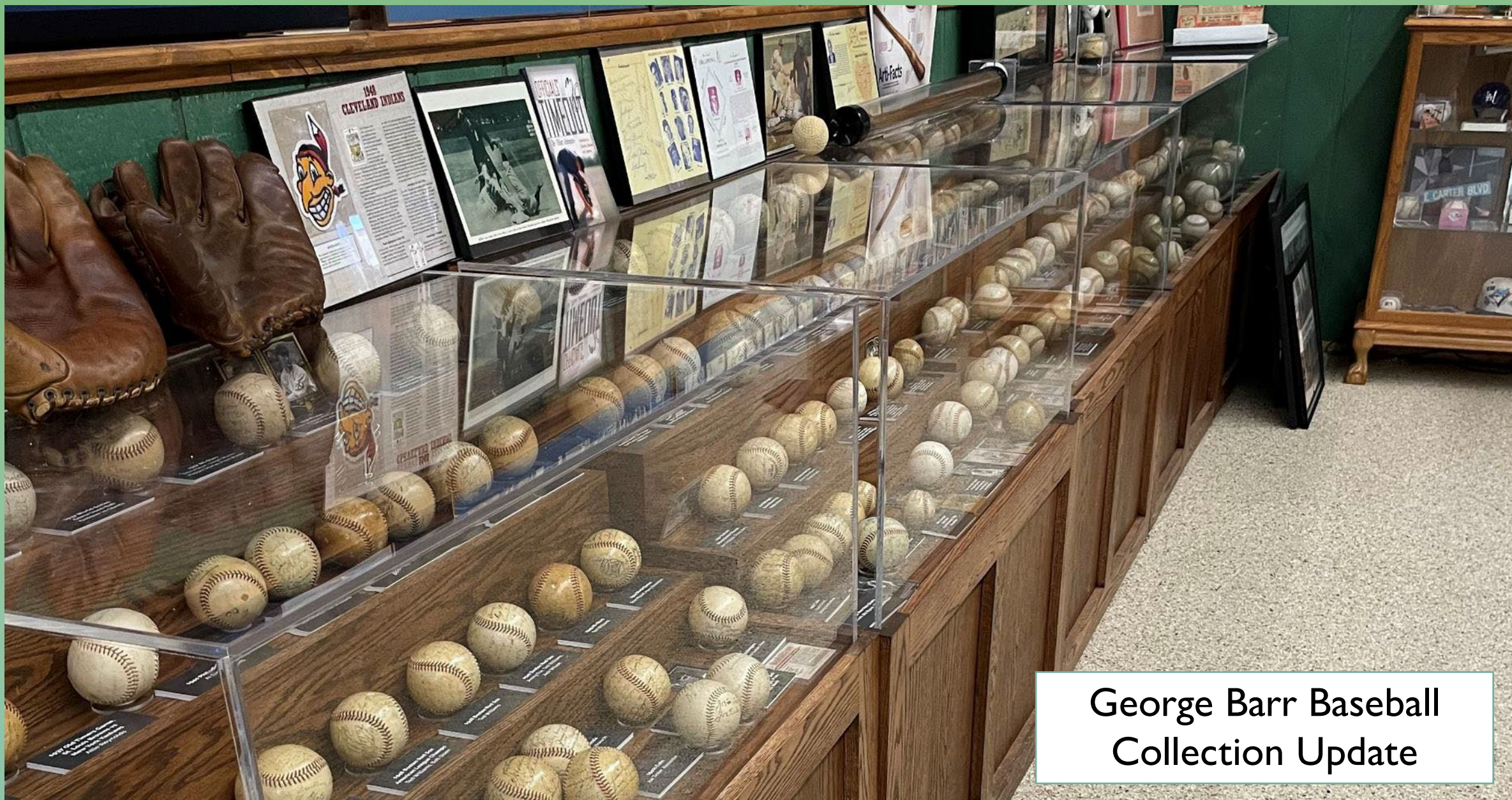
George Barr Baseball Collection Update