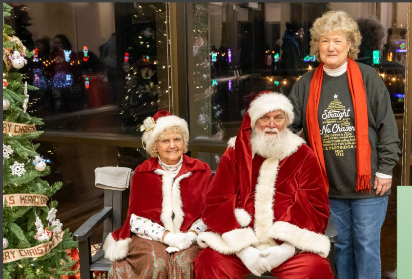
SSC Night at the Light Snowman Wonderland – December 2