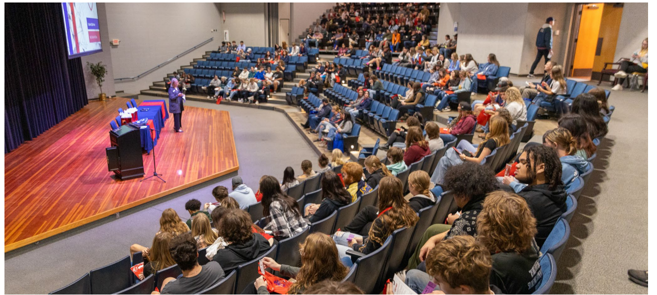
High School Visit Day – November 12 Close to 200 in Attendance Representing 22 Schools