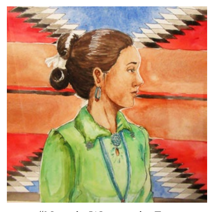
"Navajo Woman in Front of the Navajo Rug" by Amber Duboise-Shepherd

The exhibit is available to view for students, faculty and staff. It opened to the public on Nov. 1. Social distancing, limited group sizes, and face masks will be required of visitors.