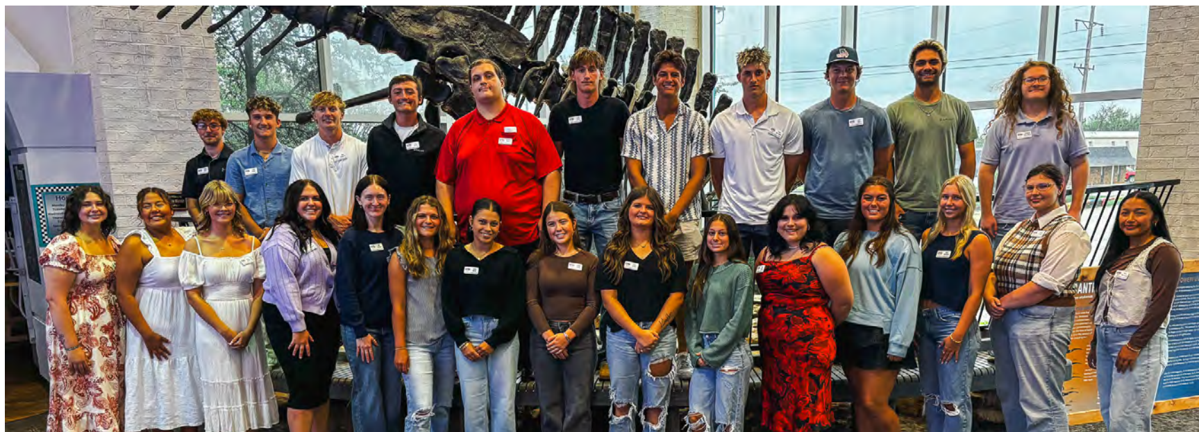
Freshmen members of the Seminole State College President's Leadership Class attended a reception at the Jasmine Moran Children's Museum on Aug. 26.

Seminole State College has selected 26 freshmen students for Class XIX of the President's Leadership Class.