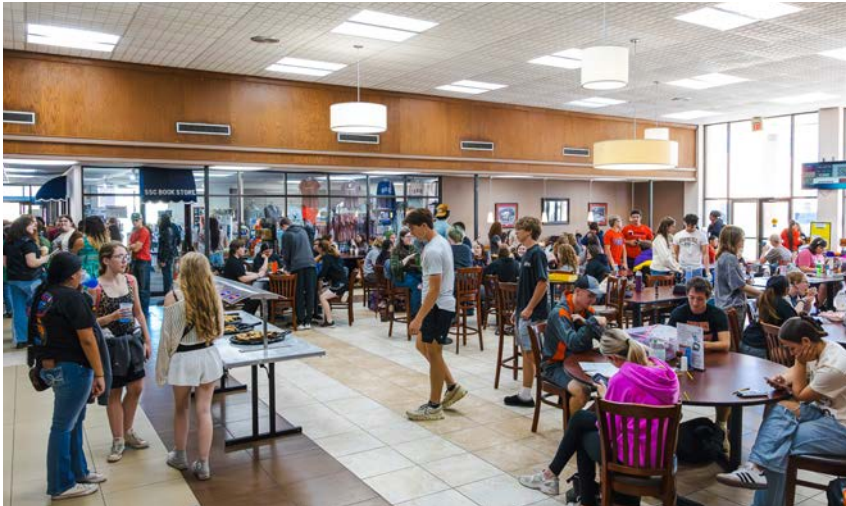
Area high school students competing in Seminole State College's 52nd annual Interscholastic Meet gather in the E.T. Dunlap Student Union.

Students from high schools across the state competed in Seminole State College's 52nd annual Interscholastic Meet on March 26.