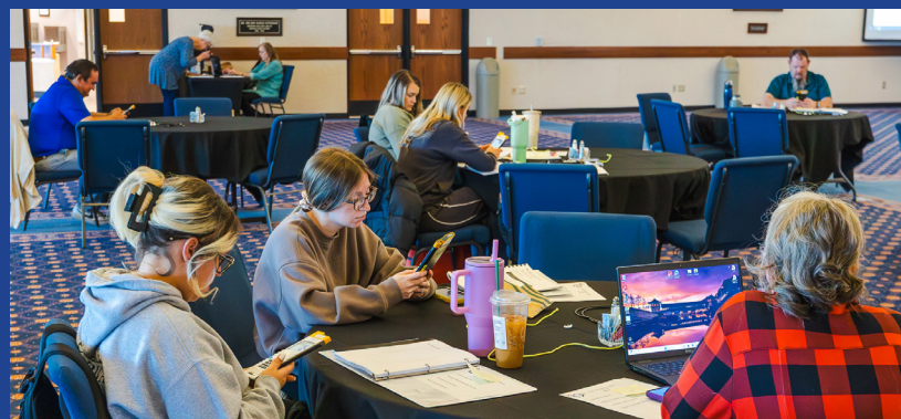
SSC's GEAR UP federal grant program hosted a TI-Nspire calculator training for area math teachers on Jan. 15 in the Enoch Kelly Haney Center Ballroom. Teachers from Holdenville, Moss, Varnum, Wewoka and Wetumka attended the Texas Instruments-led session focused on high school math readiness and classroom-ready tools.